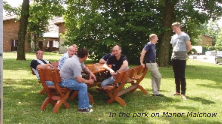
In the park on Manor Malchow