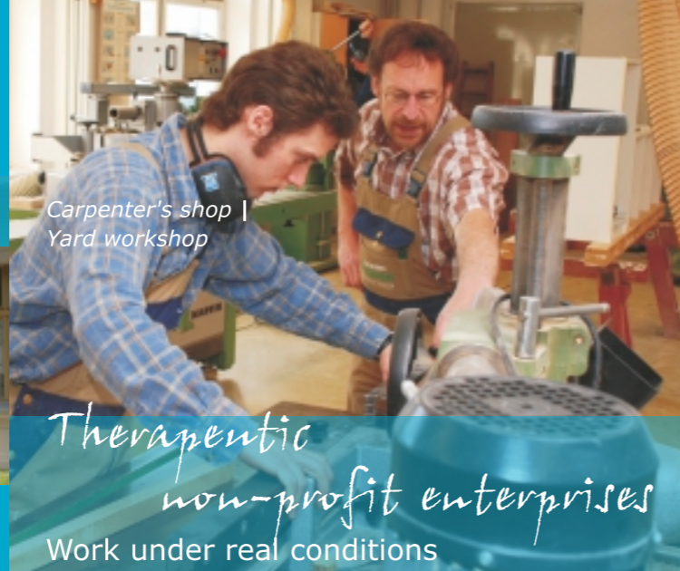
Carpenter's shop | Yard workshop