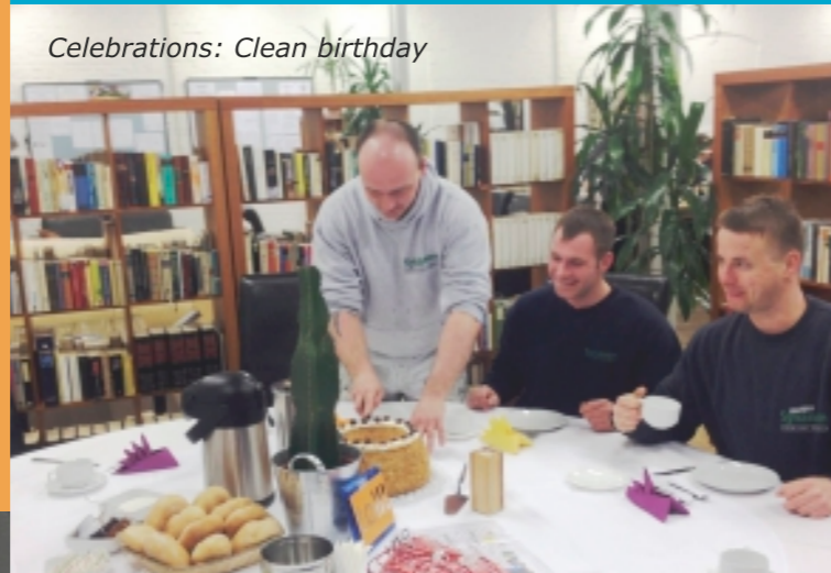
Celebrations: Clean birthday

Synanon is a self-help community against addiction that was founded in 1971 by people affected for people affected. It is our conviction that every narcotics addict has the ability to lead a drug-free life again if provided with the right setting for this.