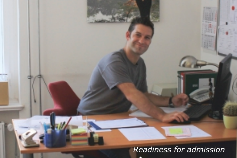
Readiness for admission