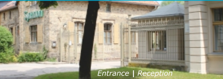
Entrance | Reception

STIFTUNG SYNANON Foundation Headquarters Admission Office Dorfstraße 9 | 13051 Berlin-Lichtenberg, municipality of Malchow