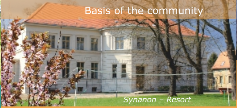
Synanon – Resort