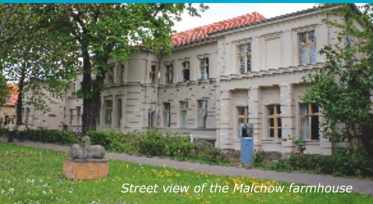
Street view of the Malchow farmhouse

STIFTUNG SYNANON Foundation Headquarters Admission Office Dorfstraße 9 | 13051 Berlin-Lichtenberg, municipality of Malchow